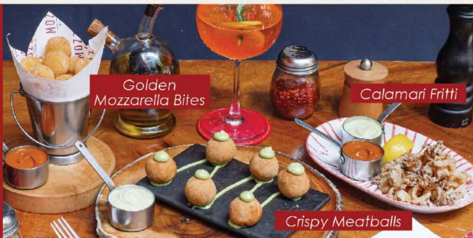
Golden Mozzarella Bites