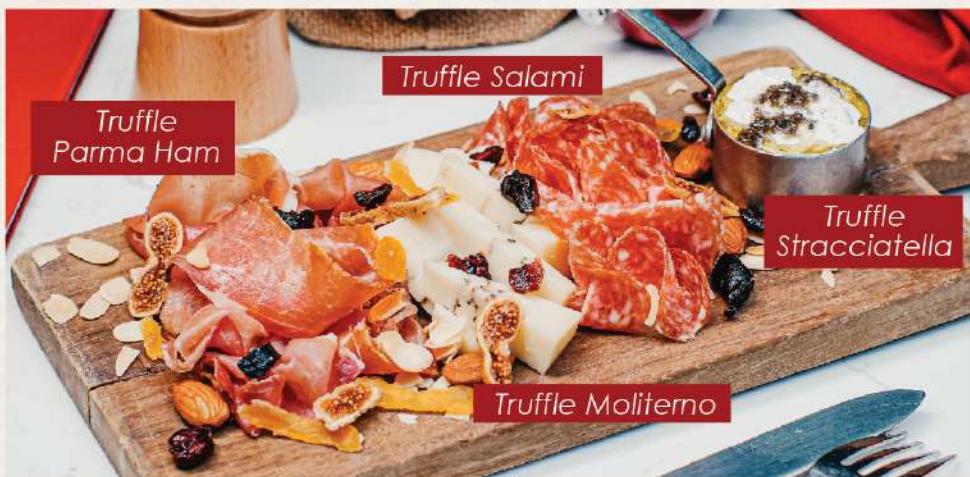
Truffle Parma Ham